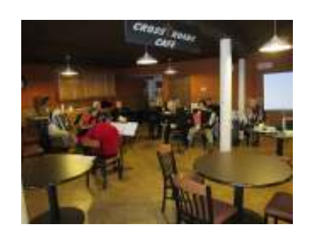
Orchestra At "Cross Roads Cafe"