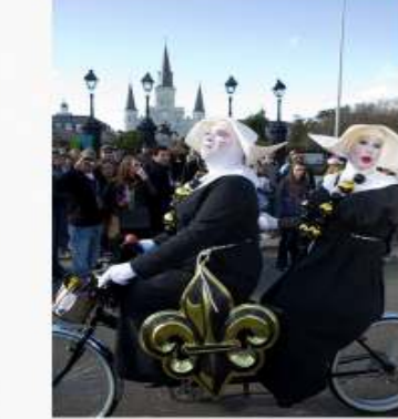
"Nuns on Parade", 17 x 22", archival prin